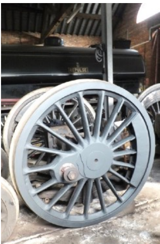
Progress at the end of June is seen here with rear axle primed (left) and centre plus front axle cleaned (right).