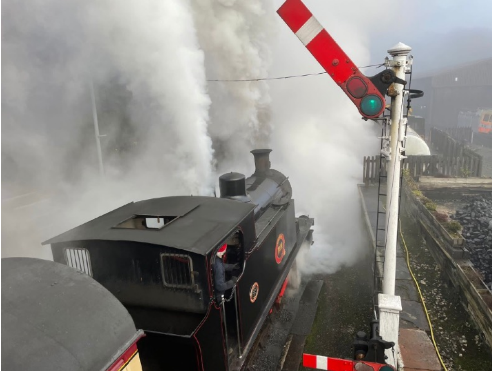
Photo (left): A Tinsel Train departs Haverthwaite with Barclay 1245 in charge.

Happy New Year! Let us hope that 2022 brings us all a year of good health and less constraints from the covid pandemic.