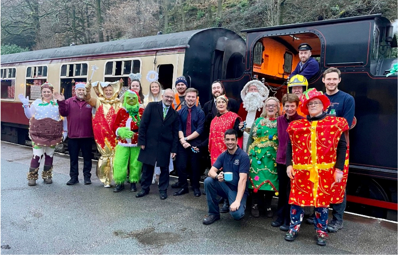
Photo (above): The Tinsel Train staff (and Father Christmas) on the final weekend of the 2023 service.

Happy New Year to all newsletter followers, friends, volunteers, contractors and staff of the L&HR!